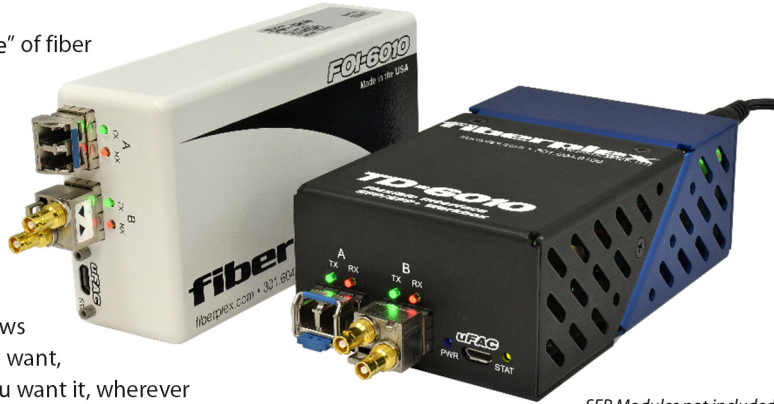
SFP Modules not included

The true "Swiss Army Knife" of fiber optic transport, the FOI(TD)-6010 in conjunction with any combination of a myriad of FiberPlex or third party SFP/SFP+ (Small Form-Factor Pluggable) optical & electrical transceiver modules, allows you to transport what you want, when you want it, how you want it, wherever you want it; all over one product solution... The FiberPlex FOI-6010 or TD-6010 and SFP/ SFP+ module should be in everyone's toolbox.