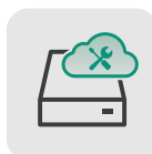
Cloud device management

Supports temperature, humidity, and illumination in meeting rooms, enabling data reporting and integration strategies.