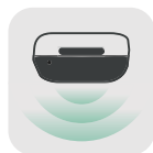
Wide detection range

Covers larger areas, reducing the number of deployed sensors and lowering enterprise costs.