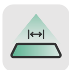
Customizable detection area

Covers larger areas, reducing the number of deployed sensors and lowering enterprise costs.