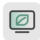
Environmental air quality detection

Utilizes Yealink's AI learning algorithm to achieve high accuracy and prevent false or missed reports.