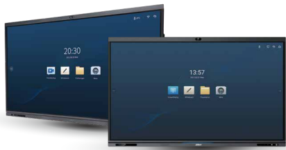
All-in-One Smart Interactive Whiteboard