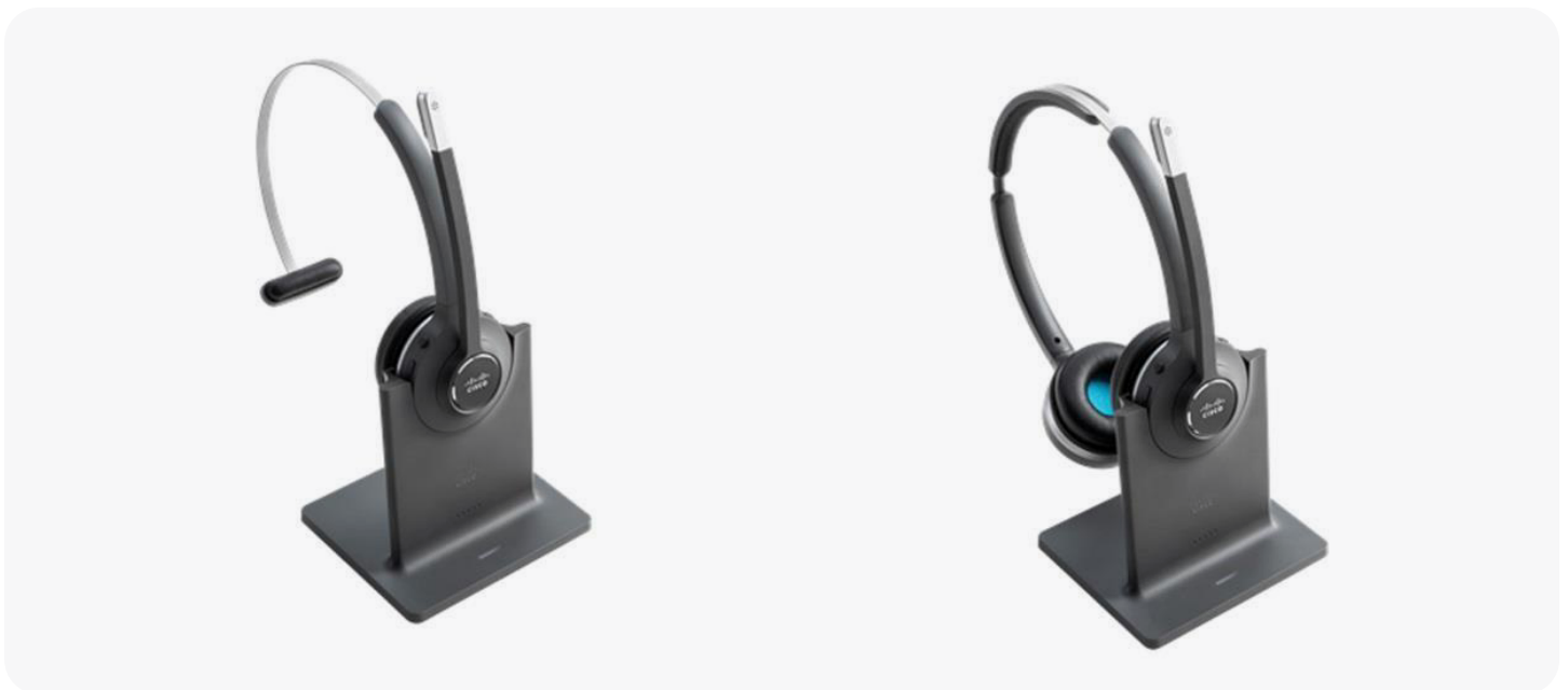
Figure 3. Cisco Headset 561 and 562 with Standard Base Station

Note: The Cisco Headset 531 and 532 terminate with quick disconnect and are bundled with either a desktop USB adapter or RJ9 cabling option.