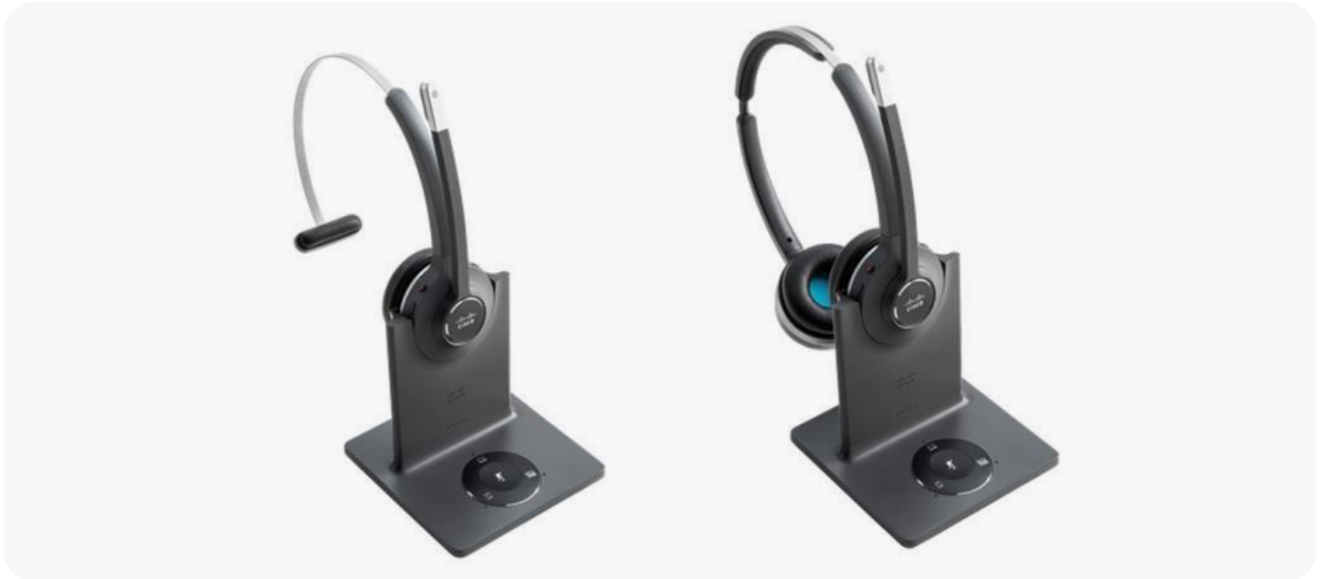
Figure 4. Cisco Headset 561 and 562 with Multibase Station