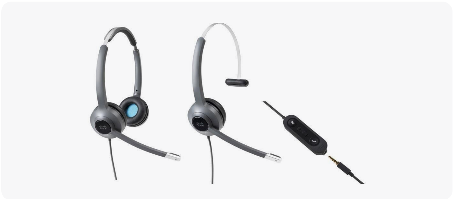
Figure 1. Cisco Headset 521 and 522 and in-line USB adapter

* Feature requires a USB interface for headsets and a compatible Cisco IP phone and firmware, or a compatible Jabber version.