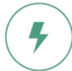
High Security Encryption