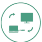
Intuitive Remote Control