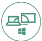
Extended Display Casting