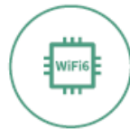
Wi-Fi 6 Chip