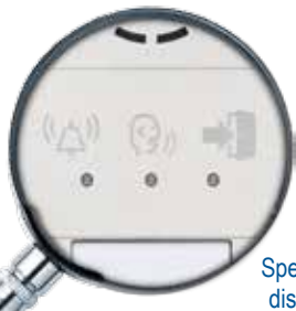
Special model for disabled people