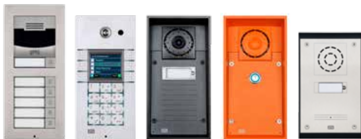
2N® Helios IP Verso