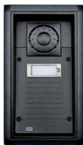
2N® Helios Force

Using the services of the existing analogue exchange not only saves costs on a new solution, but also offers a better quality and wider range of services, e.g. out-of-office redirect (to another office, voicemail, etc.) or putting a call through (e.g. from the secretariat to a particular person).