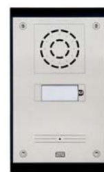
2N® Helios Uni