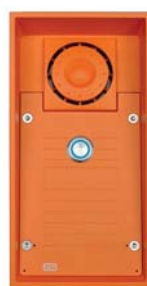
2N® Helios Safety