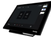
Touch 8 MAX Control panel for MAX Connect

* Miracast compatibility is pending and will be enabled via firmware update.